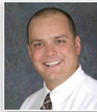
Mayor Jack M. Bacci