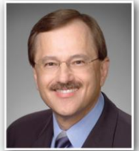
Mayor Gary W. Starr