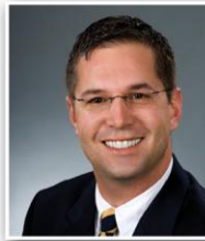
Mayor Timothy DeGeeter